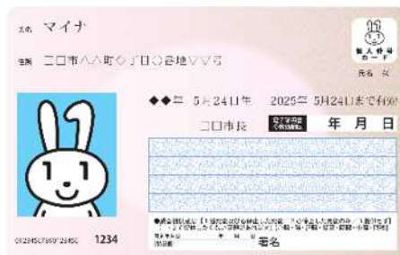
←My Number Card

The My Number Card has your My Number printed on it and can also be used as an ID card. You must follow the necessary procedures to obtain a “My Number Card.”